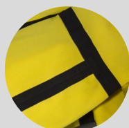
REINFORCEMENT ULTRASONIC JOINING DECORATIVE TAPING