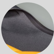
REDUCED FOLDED EDGE